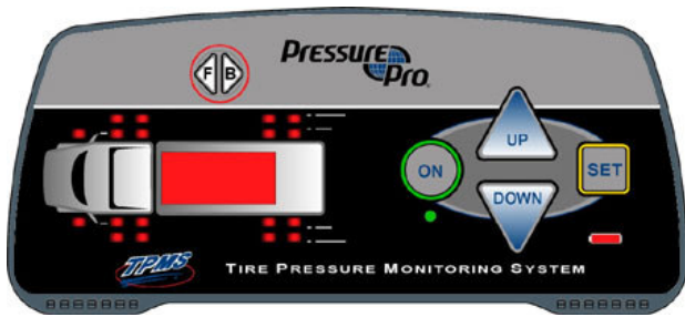
Truck & Trailer - 18 wheels