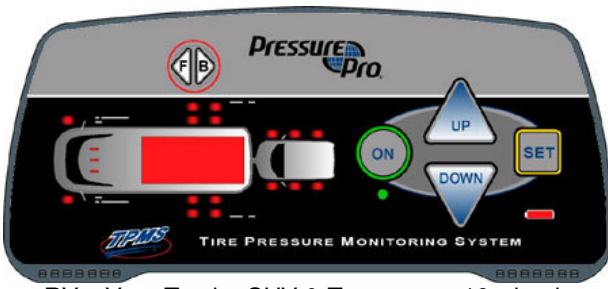
RV - Van- Truck - SUV & Tow - up to 16 wheels