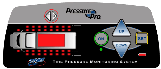
Truck & Trailer - up to 34 wheels